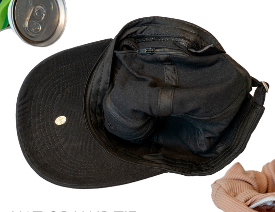
HAT OR HAIR TIE This has a convenient