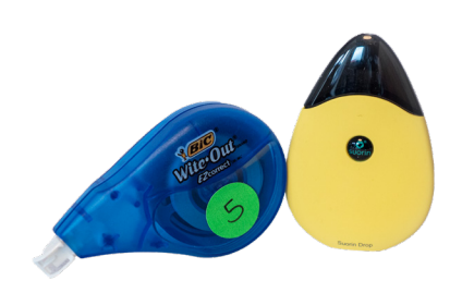
SOURIN Small reusable vape device that is commonly used for its small discreet look.